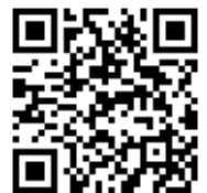
Installation & operating manual

© 2011 - Franke Foodservice Systems Inc. Due to continuous product development, Franke Foodservice Systems reserves the right to make changes in design and specification without prior notice.